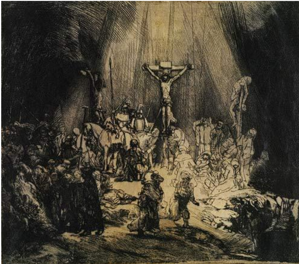
Rembrandt van Rijn, The Three Crosses (1653)

Then Jesus said to His disciples, "If anyone desires to come after Me, let him deny himself, and take up his cross, and follow Me. For whoever desires to save his life will lose it, but whoever loses his life for My sake will find it. For what profit is it to a man if he gains the whole world, and loses his own soul?